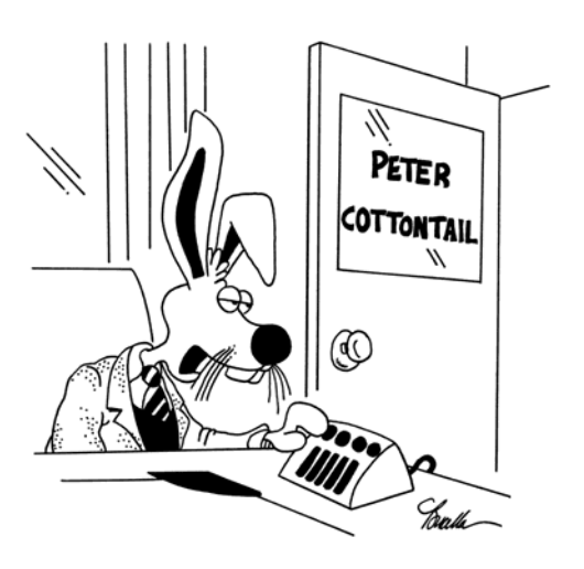
"I'm leaving now, Ms. Simpson. If anybody wants me, I'll be hopping down the Bunny Trail."