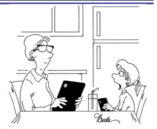
"Don't you mean you want to learn to 'Tweet,' not, 'Twerk,' Grandma?"

price that is quoted over the telephone. These prices are usually made to attract bargain shoppers, not to actually close deals. You want to lock in at the lender's posted price, which should be on the lender's website. You should also find out if there is a fee for locking in a price, which is likely. If there is, find out how much, if any, is nonrefundable.