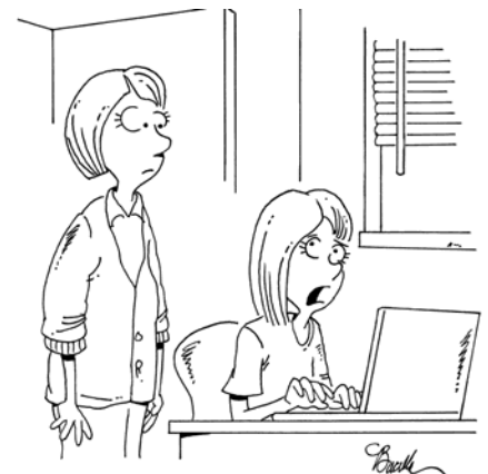
"I just read on the internet that I shouldn't believe everything I read on the internet."

Calculate the cost of an appraisal against your savings, but if your home's value has risen appreciably, this could be a good strategy.