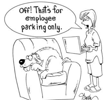
The Drawbacks Of Working From Home

Insurance may be an issue. If you rent your mortgaged home, your lender will want to be sure you have enough insurance to protect their investment in the event of a disaster. Insurance for landlords is very different from homeowner's insurance.